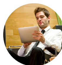
Remote Office Connectivity