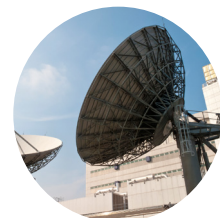
Leased Line Replacement