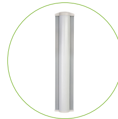
Sector antennas: 90 and 120 degrees